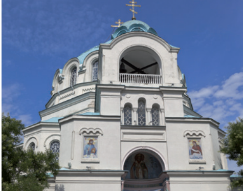
Cathedral of St. Nicholas

these three names can appear in documents referring to the city. These documents help historians reconstruct the constantly changing power relations over the years. The city has numerous sandy beaches and therapeutic mud sources, which is why it became famous as a health resort as early as the mid-19th century. Today, the development of tourism, as well as the health resort, is becoming increasingly important for the city.