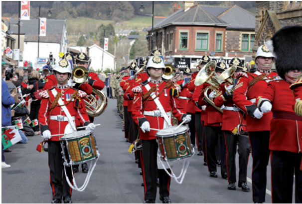
Risca Christmas Market & Lantern Parade