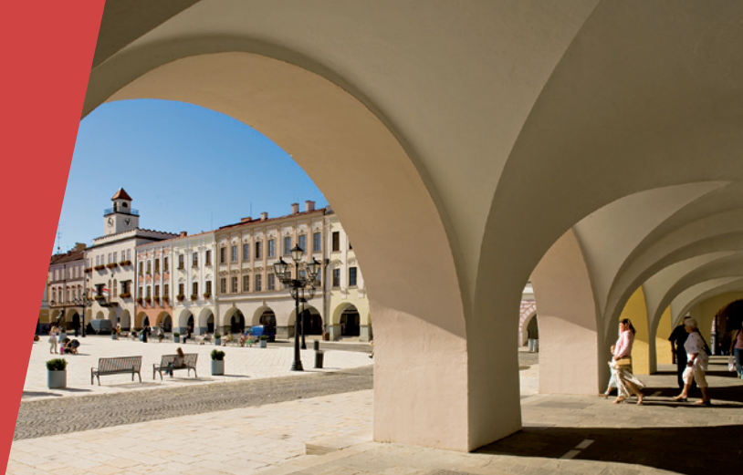
Arcades with a view of the town hall

The former “hat metropolis” in Northern Moravia, Czech Republic, with a historical city centre.