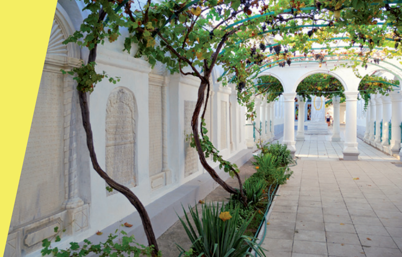
Courtyard of the temple of the Yevpatorian Karaites: the Kenesa

A maritime health resort, in the Republik of Crimea, with a long tradition, eventful history, and beautiful architecture.