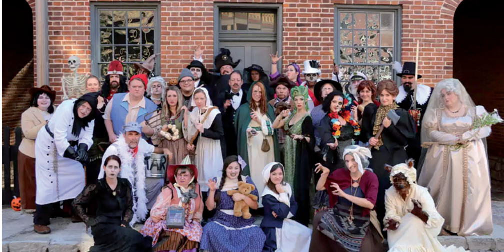
Legends and Lanterns