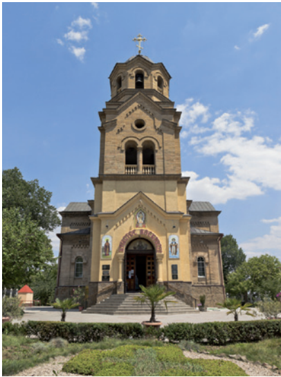
St. Elias Cathedral