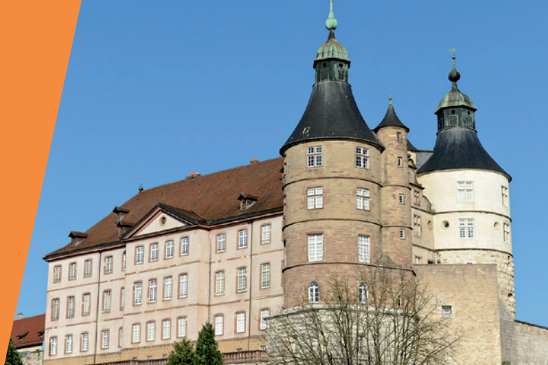
Palace of the Dukes of Montbéliard

City in the Department Doubs, France, offering history, architecture, events, and numerous culinary delights