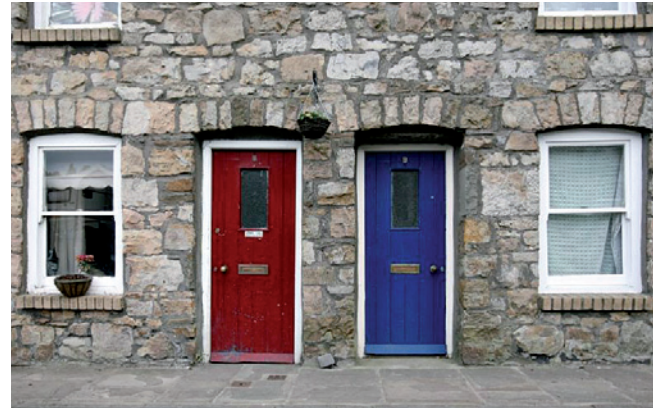
"Bute Town Heritage" mining community