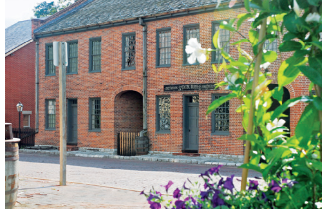
First Missouri State Capitol State Historic Site