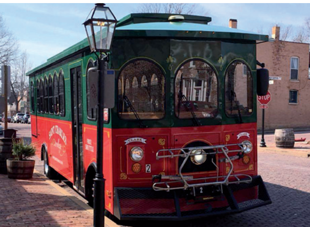
Historical bus route: the St. Charles trolley