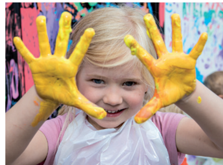
Ludwigsburg Children's Festival