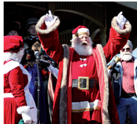
Meet & greet with Santa Claus