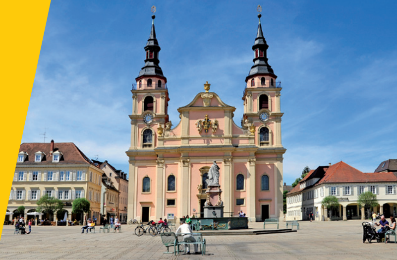
Ludwigsburg market square

Baroque meets the modern era in the heart of metropolitan Stuttgart