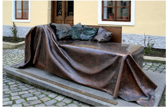
Birth house of Sigmund Freud

Tourguide Digital: a smartphone app that lets visitors playfully and instructively discover the historical sights of Nový Jičín starting in the Masaryk square.