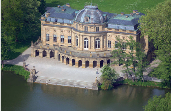
The Monrepos Lakeside Palace