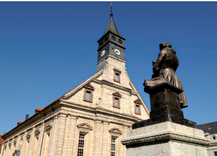
Saint Martin Church