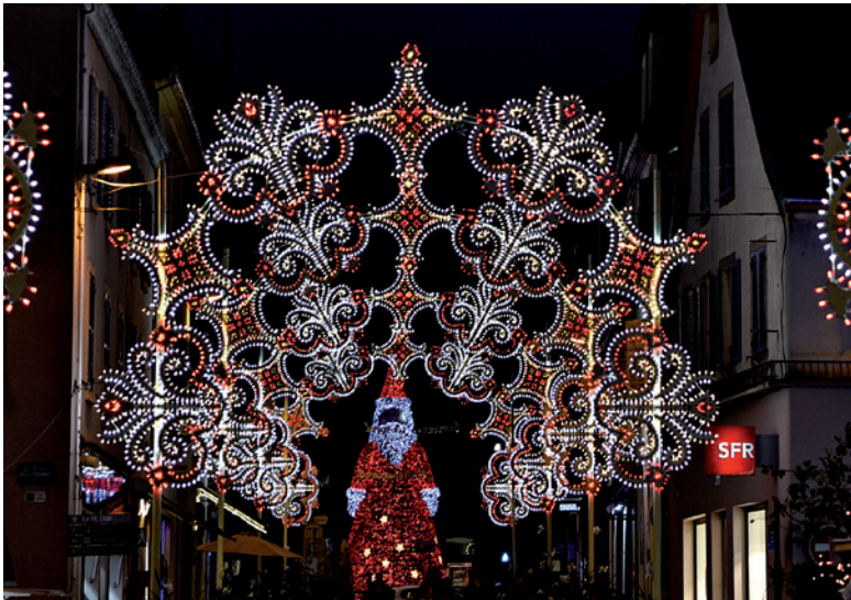
Christmas market – Lumières de Noël