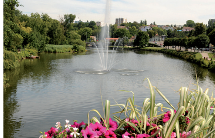
Scientific park "Près-La-Rose"