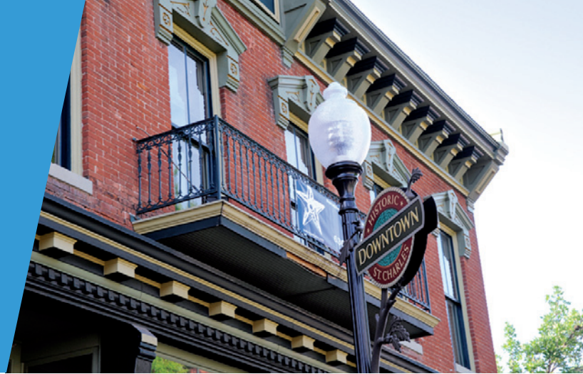
Historical city centre of St. Charles

American history, a great deal of German heritage, and picturesque landscape at the gates of the metropolis of St. Louis.