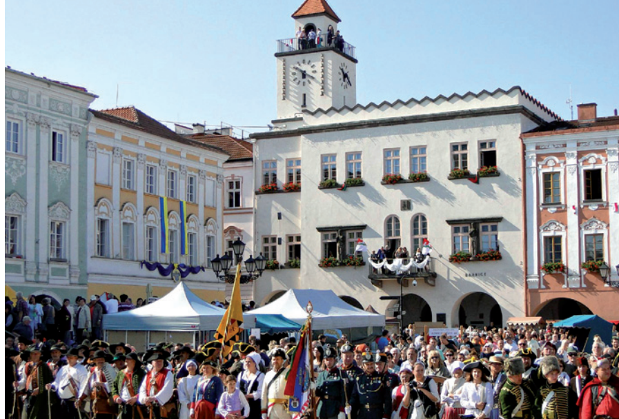
City festival with numerous attractions