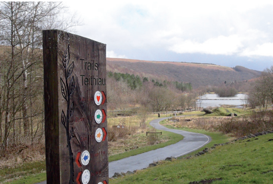
Parc Penallta with three different trails

gradually all closed until, in the late 20th century, the last mine went out of service. The majority of the spoil heaps were removed. Today, there are only a few spots where the industrial past of the area are visible. During this conversion, visible memories of the mining era were turned into meaningful meeting places (sports and outdoor fields, for example) and are now important centres of everyday life for the inhabitants.