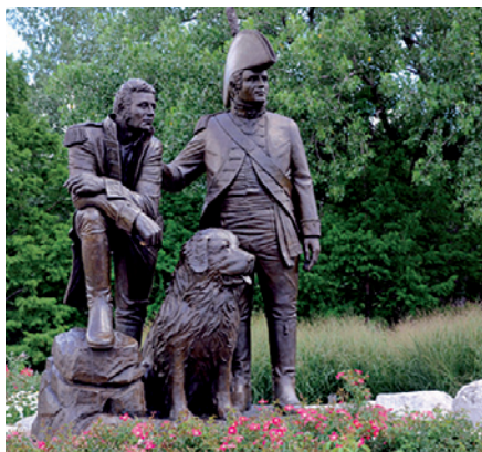
Memorial of Lewis and Clark