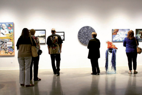
Foundry Art Centre