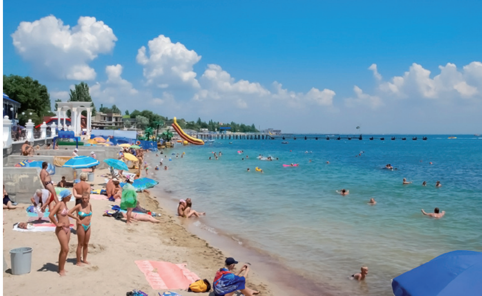
Beach of Yevpatoria

The resort season starts on 12 June, which is also Russia Day and the Day of the City of Yevpatoria. It is celebrated with concerts and lectures. Throughout the season, until the end of the summer in early September, numerous concerts and other cultural events take place. For example, warm summer evenings are celebrated in the city centre and the masterpieces of classical music are reinterpreted in open-air concerts.