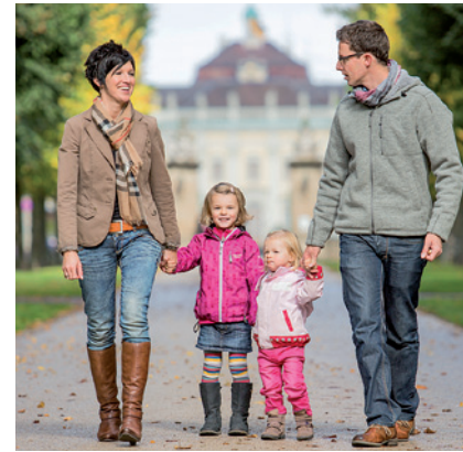
Ludwigsburg Residential Palace and Blooming Baroque