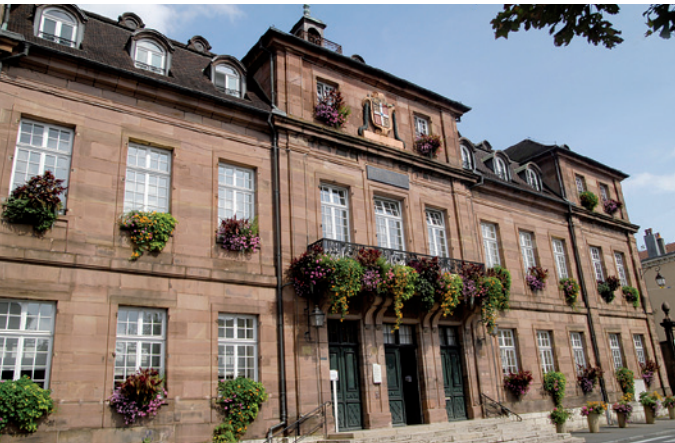
The town hall

The cities of Montbéliard and Ludwigsburg have been connected with one another for over 600 years through a close relationship – the joining of the two royal families by marriage. This long historical relationship led to the foundation of the first German-French twin town agreement after the Second World War. Montbéliard is now a modern industrial city, characterised by the automobile company Peugeot, with an appealing, historic city centre at the foot of the palace of the Dukes of Württemberg. Montbéliard is also known for the buildings constructed by the famous Renaissance architect Heinrich Schickhardt, which still define the cityscape, like St. Martin's Church built between 1601 and 1607. Montbéliard also has a beautiful landscape: as the gate to Burgundy with the nearby cities of Belfort and Besançon, and the French Jura, it is a popular destination.