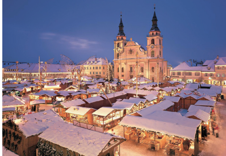
Baroque Christmas Market