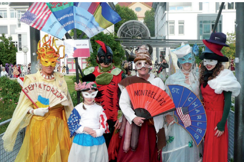
The twinning masks are presented by Councilwomen, here on the occasion of the Venetian Fair.