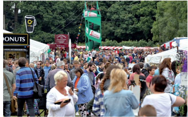
Big Cheese Festival