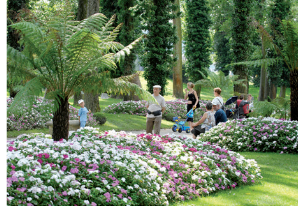
Scientific park "Près-La-Rose"