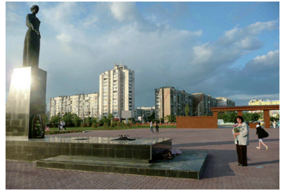
Krasnaya Gorka Memorial